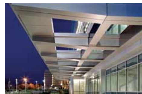
United Therapeutics Corporation Silver Spring, Maryland